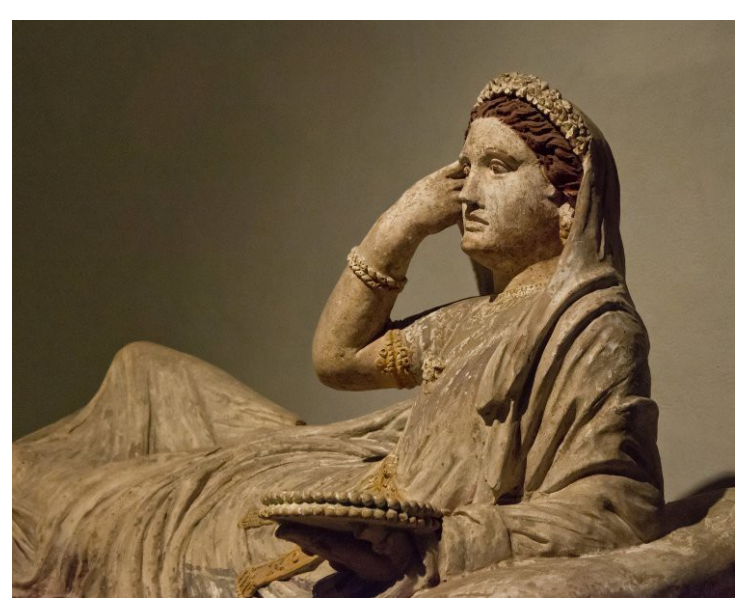
Etruscan woman portrayed at a banquet.

Romans and Greeks often criticized Etruscans because of their egalitarian attitude toward women, which is also reflected in many Scythian, Uralic, Altaic and Sumerian customs, in contrast to the Indo-European and Semitic patriarchal customs past and present. Traditions of these egalitarian societies gave great freedom and leadership positions to women, where they could even be rulers, warriors, and military leaders, treated with no prejudice over men. Whether the Etruscans had female rulers, we don't know. They also gave prominence to various goddesses who were very rare in proto-Indo-European societies and usually were borrowed later from other preceding native people they replaced. In their art, Etruscan women w often illustrated ere alongside their men, enjoying all the amenities and not treated any different than the men were. The Romans and Greeks were offended by such unheard of freedoms and egalitarian customs toward women and called such women with vile names. The Latin name for Etruscans "tuscus" for example was retained as a derogatory term in Spanish in the form of "tosco", with the meaning of "vulgar".