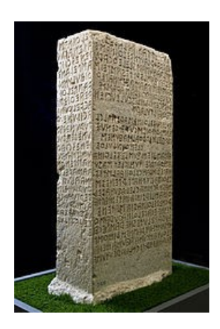
The Etruscan Alphabet

playwright known as Volnius is also recorded, although none of his works survived. The Romans admired the rich literary culture of the Etruscans. They often sent their sons to study in their schools. Besides many written texts in grave goods and illustrations, Etruscan-like texts have been found on the island of Lemnos, near Anatolia, while a very famous text was found in Egypt, written on the mummy linens. Apparently the Etruscan cloth "book" known today as the "Liber Linteus" was at one time cut up and used for bandages for an Egyptian mummy. Unfortunately most of the extensive literature of the Etruscans was destroyed in the 4th century AD during the reign of Emperor Honorius (394-408 AD)by the book-burning Christians. However, there are many shorter texts found on stone and metal objects as well as inside family crypts. Libraries with books are easily burned, however there are still around 6000 or more Etruscan inscriptions found today. Unfortunately, most of these tend to be short funerary inscriptions. Since many archeological sites have not been explored yet, we can hope that longer texts may have survived.